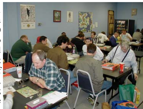
Open gaming at Little Wars